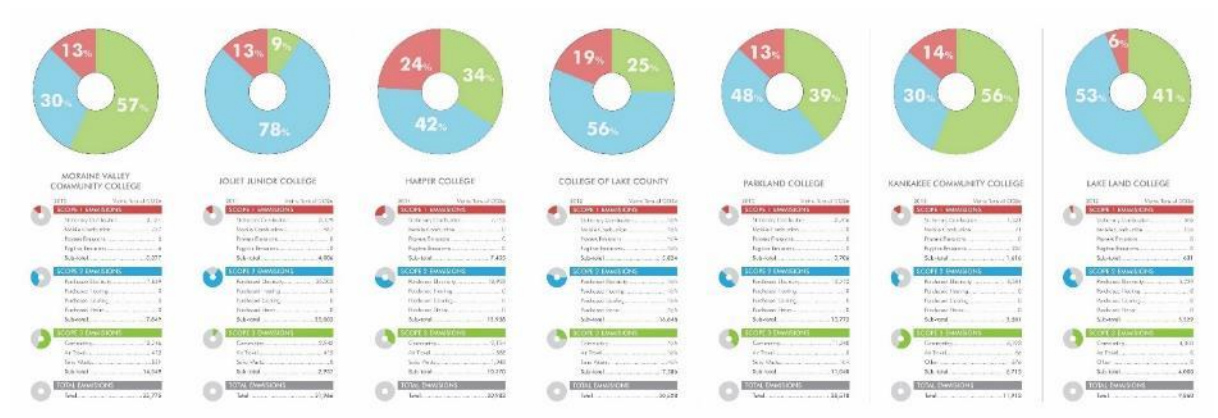
Figure 5: Carbon emissions inventory benchmarking between higher education institutions

The college implemented several key steps aimed at facilitating the climate action planning process: set up the institutional structure (committees, task force, office of sustainability; completed an initial inventory of greenhouse gas emissions; created and implemented the Climate Action Plan (completed during 2015-2016); defined target date and interim milestones for achieving campus carbon and climate neutrality. MVCC carbon emission inventory data was benchmarked with several other higher education institutions pursuing similar goals (Figure 5).