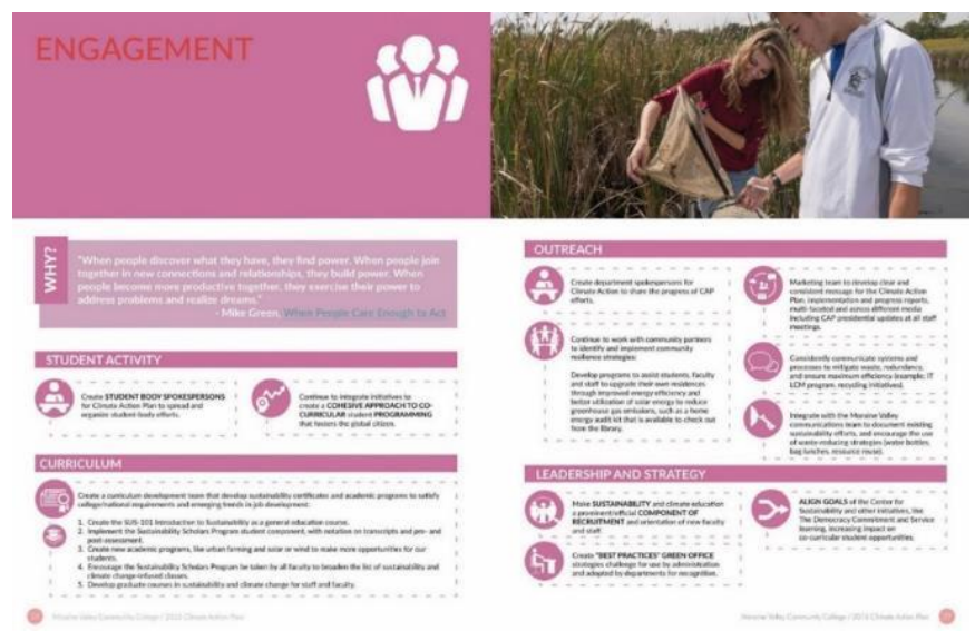
Figure 4: Community engagement strategies

Community engagement and internal culture change are critical to communicate goals of Climate Action Plan and its strategies to students and faculty (Figure 4).