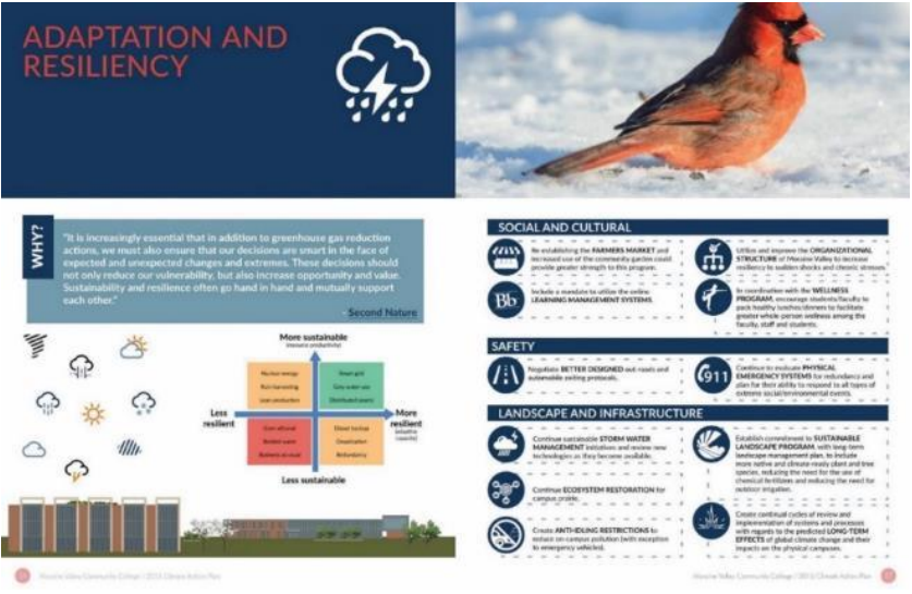
Figure 3: Adaptation and resiliency strategies

Track 4: Innovations Driving for Greener Policies & Standards