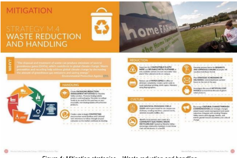
Figure 1: Mitigation strategies – Waste reduction and handling

Mitigation strategies include various energy-efficiency measures, reduction of transportation related to student and faculty commute, improvements in operation and maintenance and overall reduction of waste generated on campus (Figure 1).